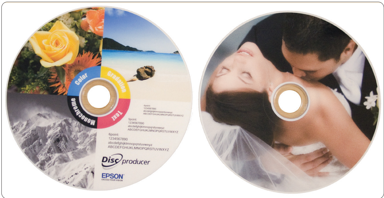
Here are two samples of the Discproducer's print quality.

The software will also tell you the status of the DVD burners, including when the printer is printing discs. You can also see what jobs are pending and keep tabs on the jobs that are completed.