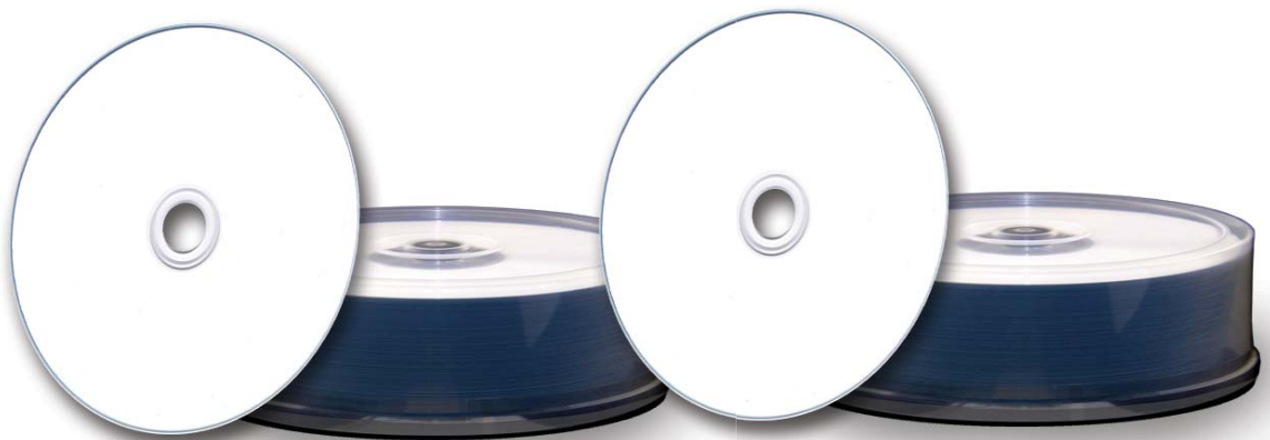
White Inkjet (BD-R and BD-RE)